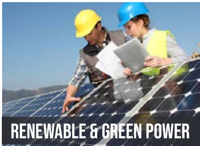
RENEWABLE & GREEN POWER