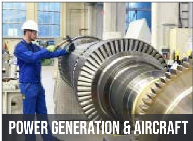
POWER GENERATION & AIRCRAFT