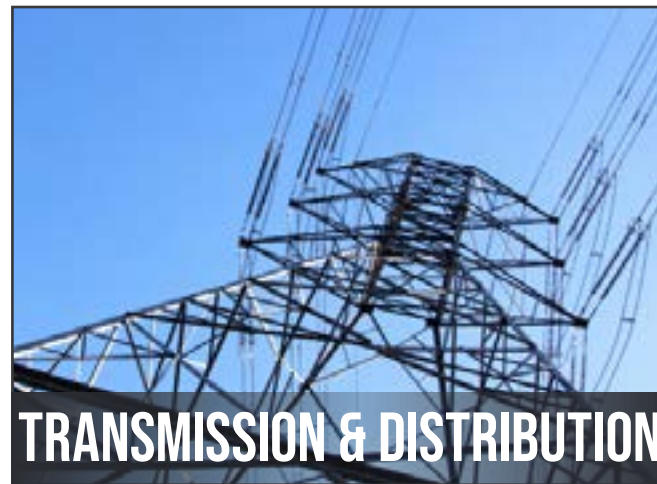
TRANSMISSION & DISTRIBUTION